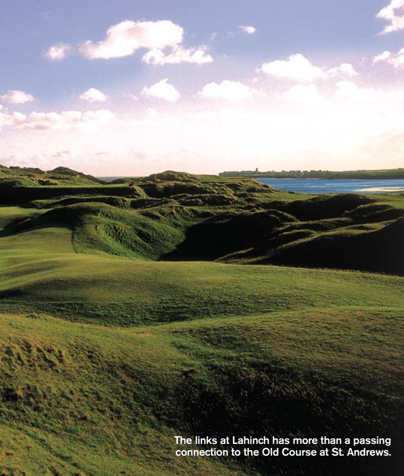
The links at Lahinch has more than a passing connection to the Old Course at St. Andrews.