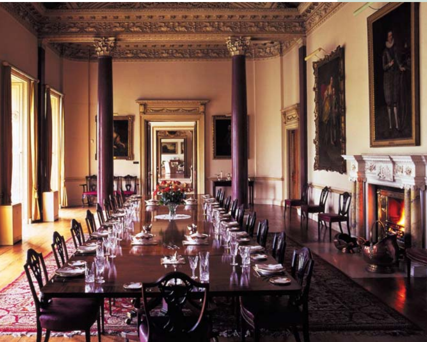
The elegant Carton House dining room reflects its long and storied past.